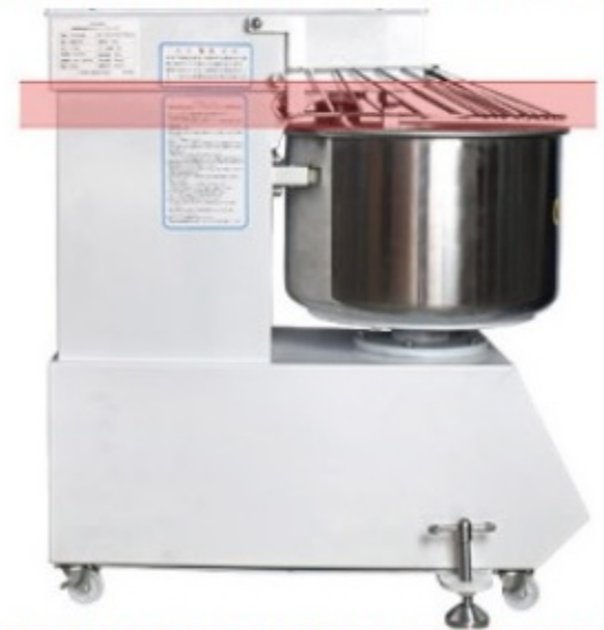
Start / stop button

If the safety cover is not closed, the machine will not start work.