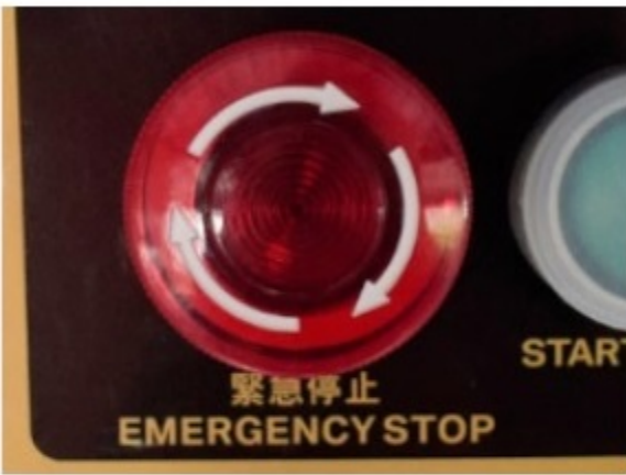
Emergency stop button