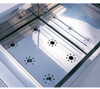
Boiling assist plate in tank

The hole heat pipes equipped at up and down 2 deck in tank enable the strong boiling power and heat efficiency 65%. And "Hot water supply device utilizing exhaust heat" equipped. So, scum and slime are removed by overflow without temperature drop in tank.